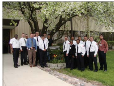
Members of the Chicago Fire Prevention Bureau with the UL hosts.

On April 29, UL's Fire Protection Division hosted a training session for the Chicago Fire Prevention Bureau. The training session included a discussion of firestop system ratings and requirements, a discussion of UL's role with the Regulatory Community and a tour of UL's Fire Protection