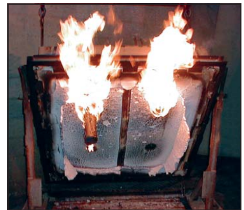
Example of a through-penetration firestop test.

For more information, please call the Fire Equipment Service Group at 1.800.677.5227.