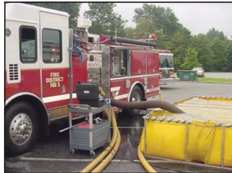
FES staff tests a pumper on location in a fire department's parking lot.